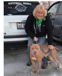
It's a Pittie Rescue & Rocky