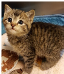
Animal Heartline Humane-Frankie