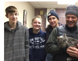
Chives going home with his new family.