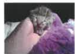
Gus at about 5 days old.