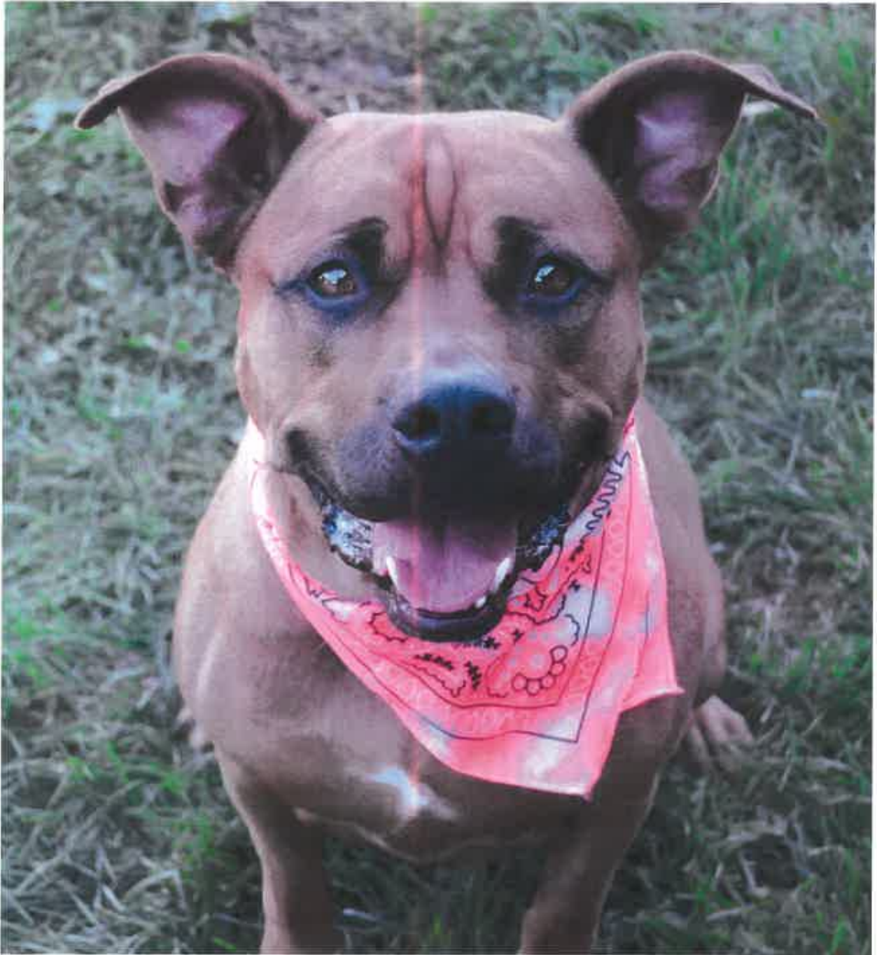
LUCY- BOXER MIX, 120 DAYS AT THE SHELTER